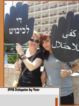
Delegates at Women in Black vigil.