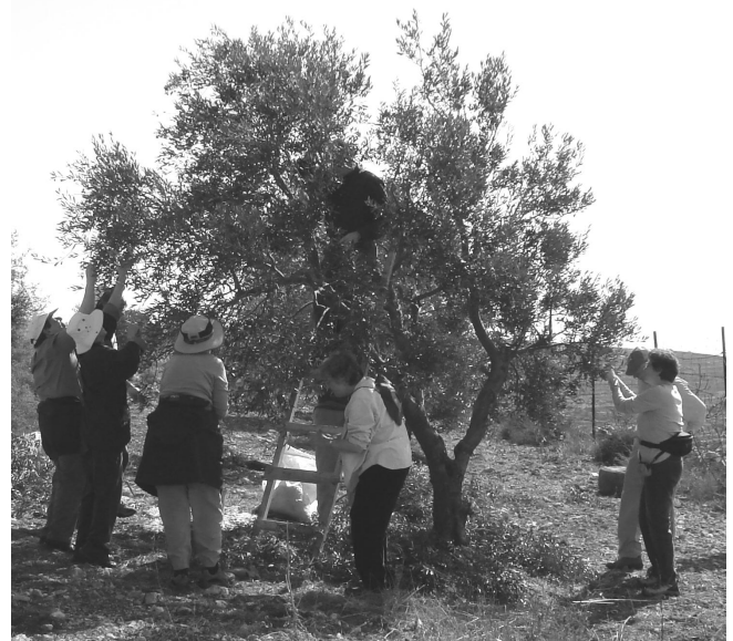
Delegates picking olives on a Palestinian farm, November 2006

delegation programs that focused on coordinating our work.